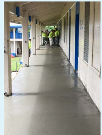
Above, left: Rusted railings are being replaced. Second from left: Existing concrete has cracks and spalling. Third from left: New rebar is laid to support new concrete flooring. Top, right: A crew from E&W Construction pours new concrete.