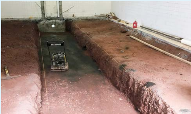
A new foundation and flooring is prepped at Matafao Elementary

Projects have been completed at nine different schools to renovate restrooms with new fixtures, plumbing and flooring. Work at Matatula Elementary is in progress with work at more schools planned for the future.