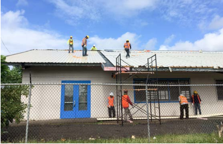
A new preformed metal roof is installed at Tafuna Elementary