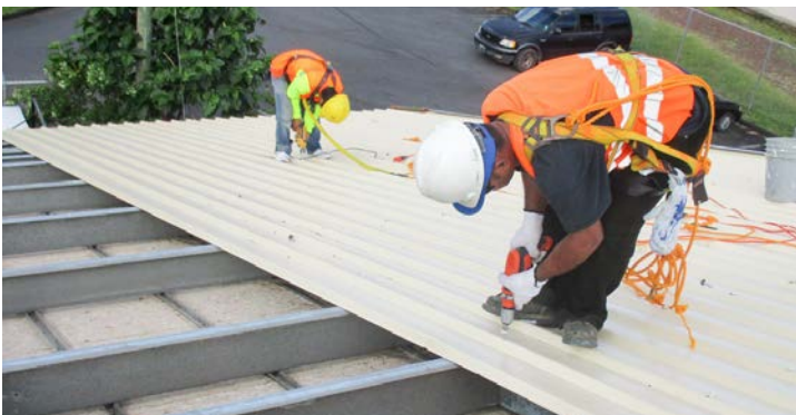
Workers from local contractor Global Tech Limited install new roofing on the cafeteria of Tafuna Elementary School